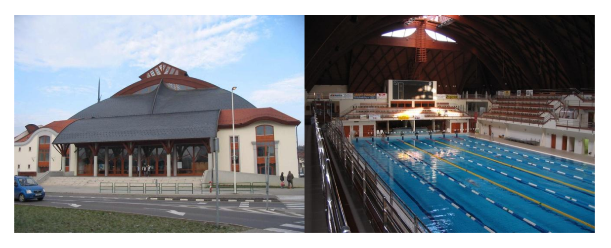
Address: H-3300 Eger, Frank Tivadar u. 5.- Hungary

The swimming pool has a length of 50m., a width of 8 lanes, depth of 2m, electronic scoreboard and about 1500 spectator's seats. The temperature of the water is 26 \,^{\circ}\text{C} + 1 \,^{\circ}\text{C} .